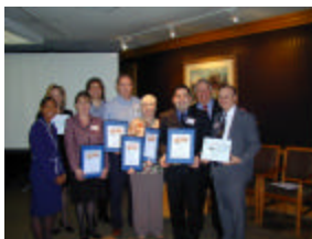
2004 Award Recipients