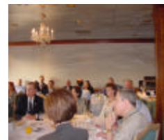
Chamber members at Networking Breakfast

To get the base price of $ 15 per person, reservations are required no later than Tuesday, the 18 th at noon. Walk-ins are welcomed, but without a reservation by Tuesday at noon the price is $20. So reserve your spot and come see what all the talk is about!